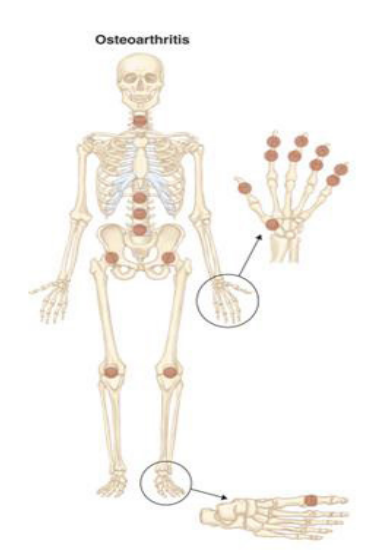
Figure 2. Joints involved in osteoarthritis

Osteoarthritis predominantly involves the weight-bearing joints, including the knees, hips, cervical and lumbosacral spine, and feet. Other commonly affected joints in-